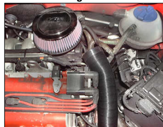
Fig. # 11