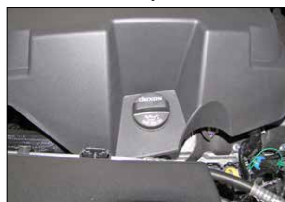
5. Remove the oil cap.