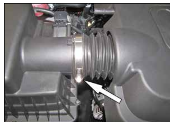
4. Loosen the hose clamp that secures the intake tube to the air filter housing.