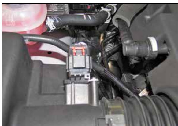
2. Disconnect the mass air sensor electrical connection.

1. Turn off the ignition and disconnect the negative battery cable. NOTE: Disconnecting the negative battery cable erases pre-programmed electronic memories. Write down all memory settings before disconnecting the negative battery cable. Some radios will require an anti-theft code to be entered after the battery is reconnected. The anti-theft code is typically supplied with your owner's manual. In the event your vehicles anti-theft code cannot be recovered, contact an authorized dealership to obtain your vehicles anti-theft code.