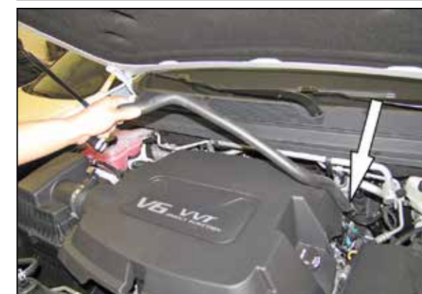
3. Disconnect the crank case vent hose from the intake plenum and then disconnect it from fitting on the valve cover and then remove it from the vehicle.